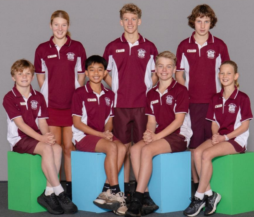
2024 • Narembeen District High School Student Council

The uniform is ordered in through our P&C and is very reasonably priced. Please ask at the front office for information regarding purchasing the items required.